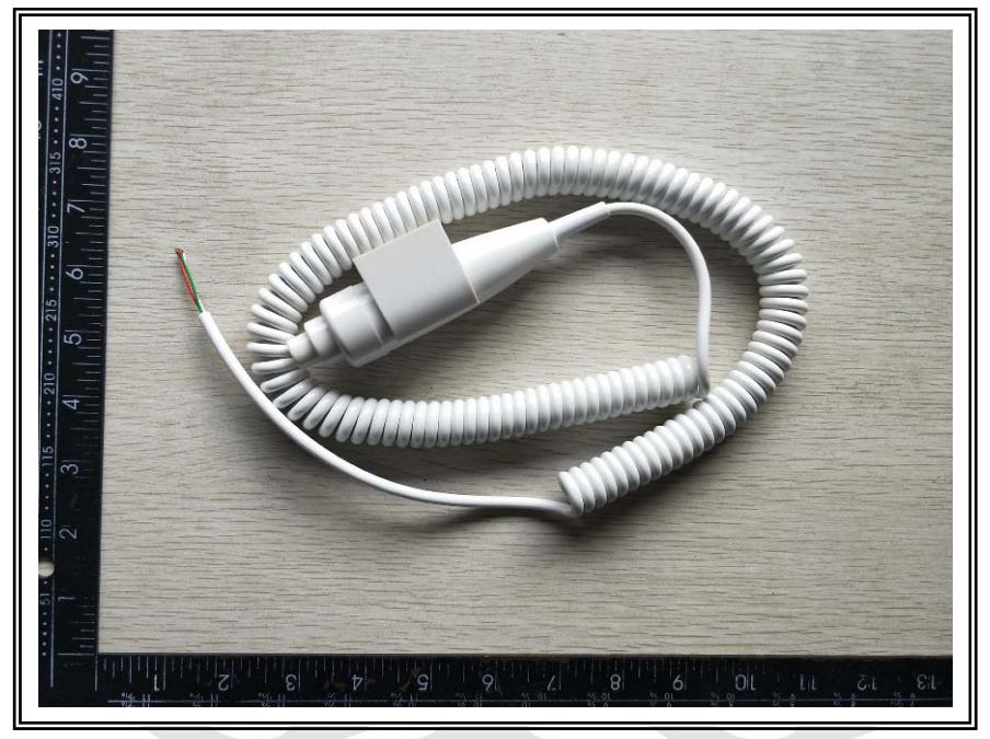
Test item: X-ray hand switch Tested Model No.: F29-9A